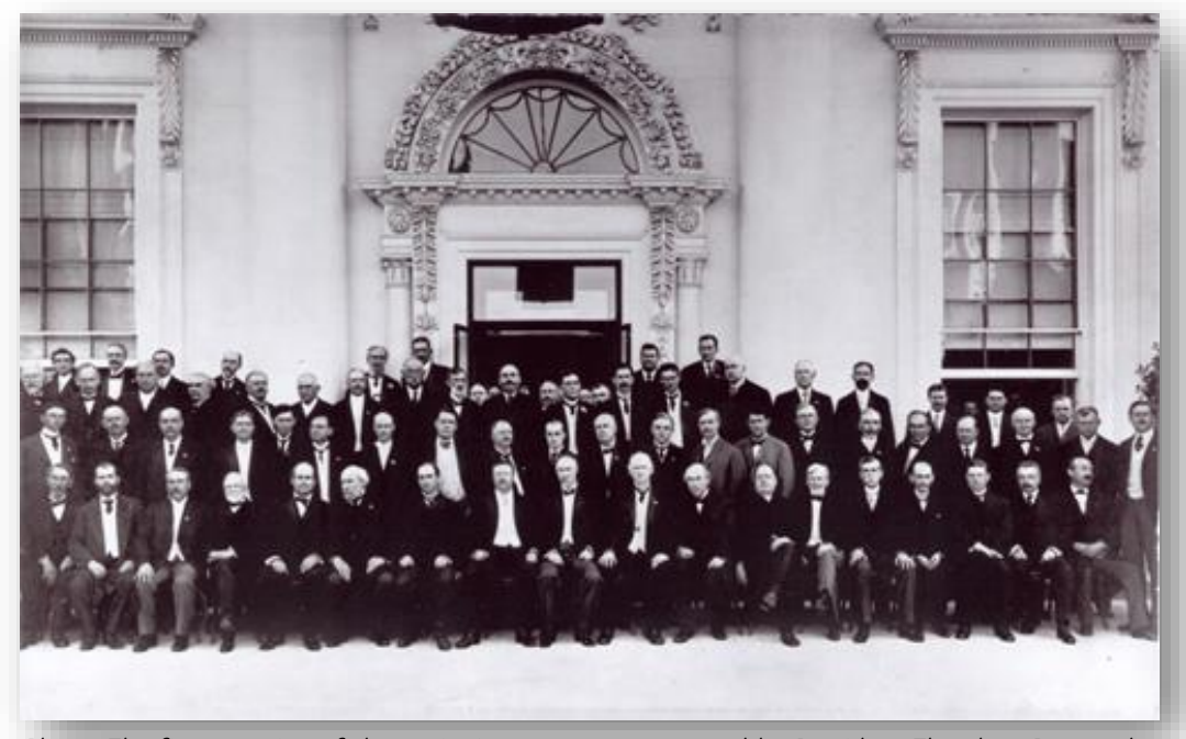
Photo: The first meeting of the nation's governors, convened by President Theodore Roosevelt in Washington D.C., 1908.

The May 1908 meeting of President Theodore Roosevelt and governors led to the creation of the National Governors Association.